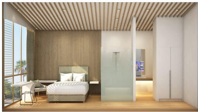
Hotel Room of the Future by Delporte Hospitality

prototype that they reflect the coming horizons for 2020; that is, by integrating industry standards for sustainable development and innovative technology.